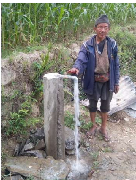
Figure: Completion of the Namichet irrigation project