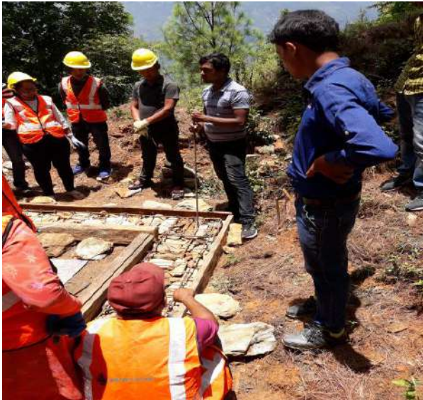
Figure: Mason training being given to locals