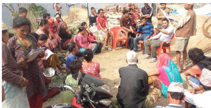
Figure: A regular CO meeting discussion

DEPROSC-Nepal facilitates communities for participatory well-being ranking to identify and categorize individual households of a settlement as :Ultra poor (food security under 3 months), medium poor, poor (food security under 6 months) and non-poor, with food security as one of the deciding factors. Keeping the target communities at the driving seat, the ultra poor, medium poor and poor are organized into COs with 80 percent of CO member being from vulnerable groups. Furthermore, to out in words the views of vulnerable groups, it is made mandatory for 50 percent of CO members to be women and the key positions to be fulfilled by poor women, Dalits and Janajatis. The COs identify and prioritize community projects and sub projects based on the problems and needs enlisted by each member or group of members.