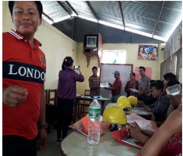
Figure: Certificate distribution for the 7 day long mason training as a part of earthquake relief