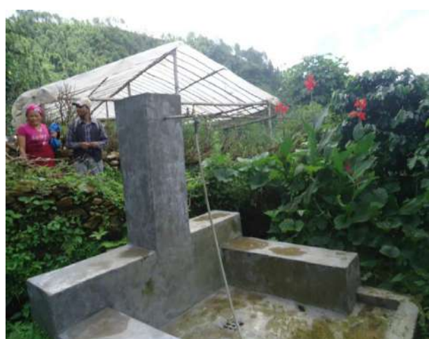
Figure: Khalchet Drinking Water System