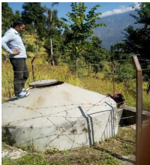
Figure: Monitoring of Sisnery Sim DWS

Therefore, there were continuous monitoring and follow up from DEPROSC Nepal followed by Ministries, World Bank and PAF.