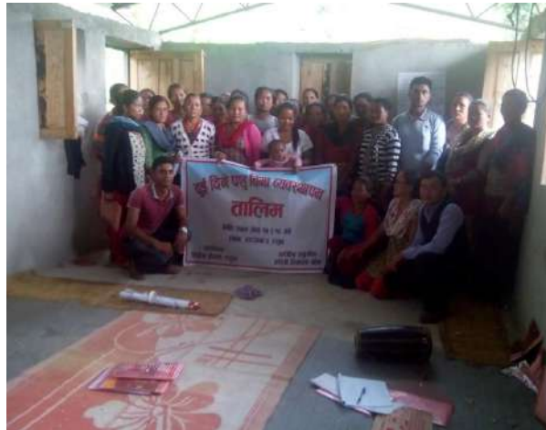
Figure: Participants of Animal Health Management