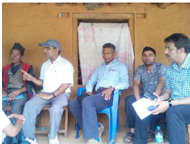
Figure: A council of ministers, the program secretary and the working director of PAF monitoring the implementation of revolving fund